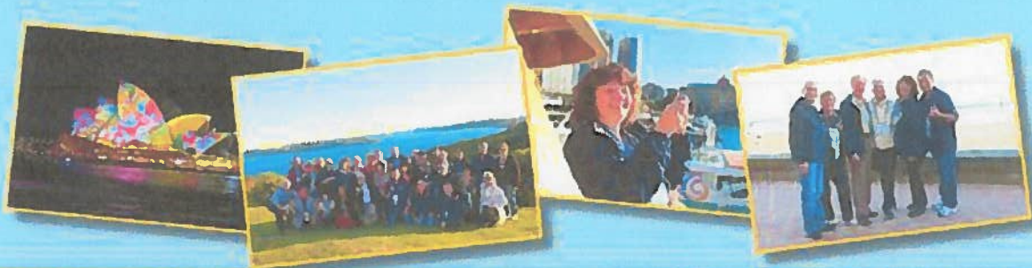
District 5000 members enjoy the 2014 Rotary International Conference in Sydney, Australia